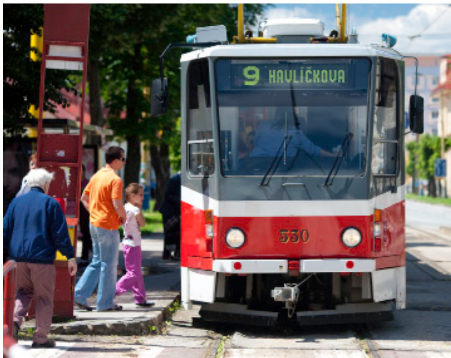
The festival ID lets you ride city trams and buses for free.

Take Zborovská street to Šturova street. Turn left. On Šturova, continue, passing the Steel Arena. Just after the arena, take a right on Toryská.