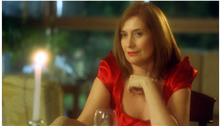
Assumpta Serna in the Spanish film "Champagne Supernova," one of the films to be shown this year in the Europe on Screen series.

The official opening of the festival will take place at 6 p.m. in City Cinema. Informal discussions at the cinema will follow, and then, starting at 9 p.m. in the City Park, delegates are invited to take part in the Essence of Kosice activities.